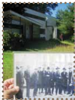
Gropius House and Bauhaus luminaries.

AU's Health Science Initiative which is focused on the development and application of Auburn's health science based resources. He continues to serve on the faculty of AU's Honors College Human Odyssey Program in Europe and participates in the AU / UGA - Man, Machine and Environment (MME) seminar which included a tour of the Walter Gropius House in Lincoln, MA this past summer.