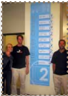
Student Center Signage