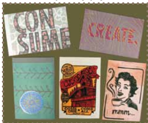
GDES student letterpress work