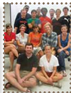
Student Advisory Council