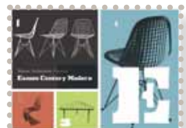
Bethany Heck Eames Font Specimen Cover