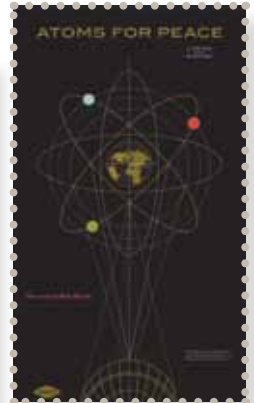
Atoms for Peace