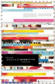
2009 DI Poster

Two of the projects Kelsey worked on were the AU Rual Studio Skatepark and Atoms for Peace posters.