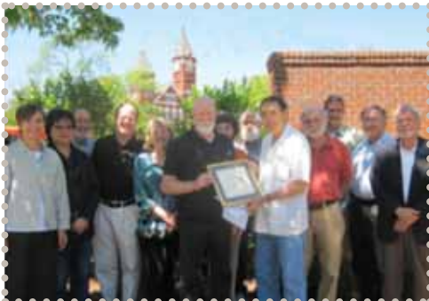
CADC College of Fellows