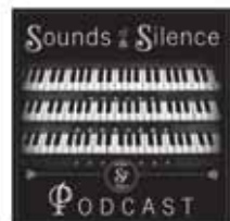
Tara Baker Silent Film Museum Logo