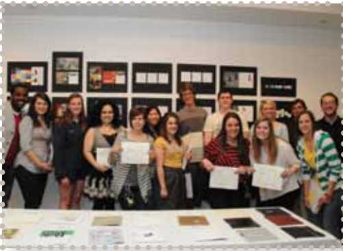
GDES Juried Show Award recipients