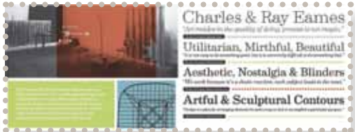
Bethany Heck Eames Font Specimen Book spread