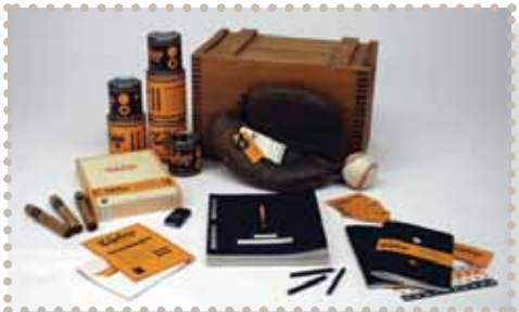
Bethany Heck Eephus League Identity + Collateral