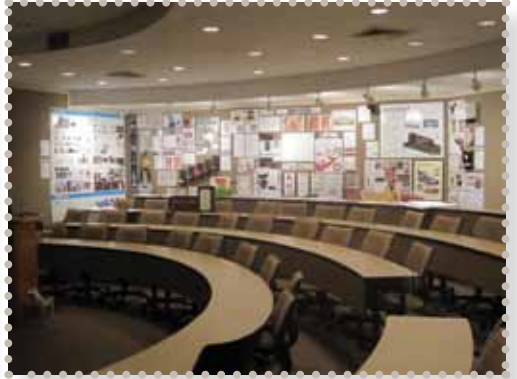
Wallace Hall lecture room 107