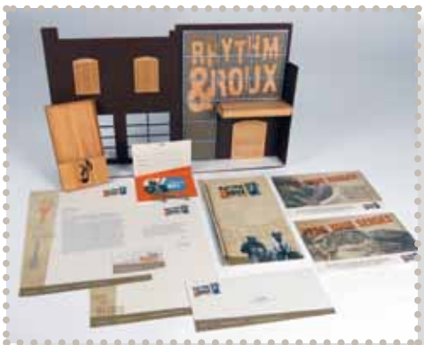
Tara Baker Rhythm & Roux Identity + Collateral