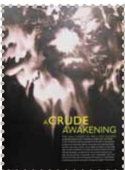
Student Show Poster