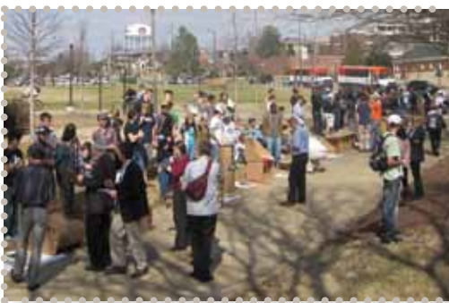
INDD Designing Green