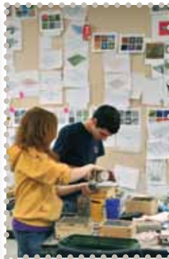
Summer Design Workshop 2nd Year "Foundations Studio"

engagement. In addition, the group visited faculty/graduate students at the University of Dundee (Scotland).