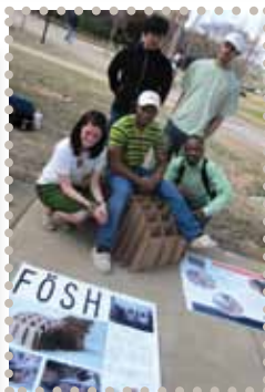
Designing Green Team