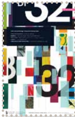
2010 DI Poster