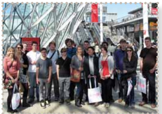
Milan Furniture Fair