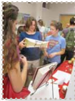
Senior Project Show