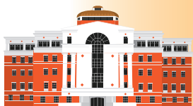
Lowder Hall, home of the Office of Professional & Career Development

ENTRY LEVEL SALARY RANGE: $30.0K - $43.0K