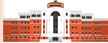
Lowder Hall, home of Harbert College of Business academic advising and the Office of Professional & Career Development.