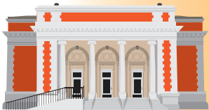
Mary Martin Hall, home of the Auburn University Career Center