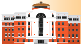
Lowder Hall, home of the Office of Professional & Career Development

These are just three options out of many that supply chain management majors pursue. For more career options be sure to check out "What Can I Do With a Major In..." on auburn.edu/career .