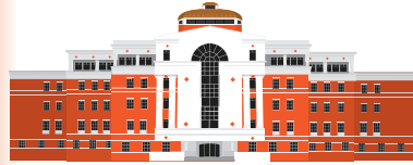
Lowder Hall, home of Harbert College of Business academic advising and the Office of Professional & Career Development.