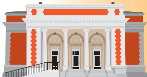
Mary Martin Hall, home of the Auburn University Career Center

ENTRY LEVEL SALARY RANGE: $28.0K - $35.0K