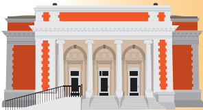
Mary Martin Hall, home of the Auburn University Career Center

This program exposes students to the basic principles of wildlife management while at the same time preparing them for veterinary school either at Auburn or other schools. This degree is predicated upon you furthering your education. Be sure that you seek opportunities to enhance your candidacy whenever possible.