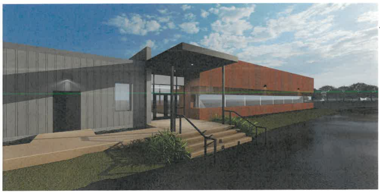
North Elevation, Front Entrance